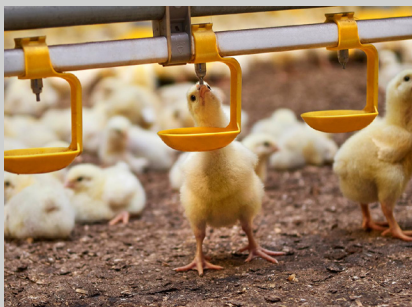
Line Disinfecting For Biofilm

*SOLUTION RETAINS EFFICACY FOR 7 DAYS WHEN ADDED TO WATER AND KEPT IN A CLOSED CONTAINER AND FOR 24 HOURS WHEN ADDED TO AN OPEN CONTAINER.