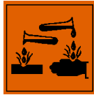
C - Corrosive

Hazardous ingredients : Sodium hydroxide R-phrases : R35 - Causes severe burns S-phrases : S2 - Keep out of the reach of children S26 - In case of contact with eyes, rinse immediately with plenty of water and seek medical advice S27 - Take off immediately all contaminated clothing S36/37/39 - Wear suitable protective clothing, gloves and eye/face protection S45 - In case of accident or if you feel unwell, seek medical advice immediately (show the label where possible)